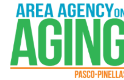
AAAPP Corporate and organizational support Vs. Individual Giving