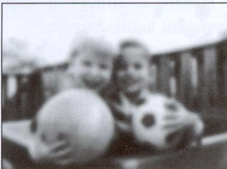
Scene as viewed by a person with cataract.