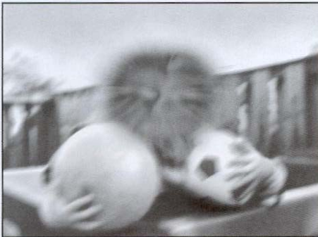
Scene as viewed by a person with age-related macular degeneration.